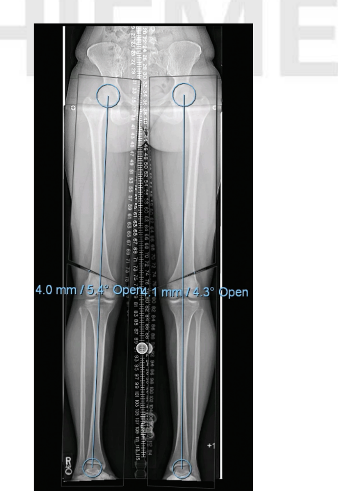
Fig. 3 Measuring osteotomies using the Sectra osteotomy tool.

The Sectra osteotomy tool (accessible via Ortho Toolbox \rightarrow Knee \rightarrow Osteotomy) requires five simples steps with a userfriendly guide that demonstrates each click: (1) center of femoral head, (2) center of tibial plafond, (3) first end-point of osteotomy, and (4) second end-point of osteotomy, (5) manipulate/pivot the image until the desired mechanical axis is achieved. The femoral and tibial osteotomies were drawn as described above. The final output yields an angle and wedge size as shown in ~Fig. 3 .