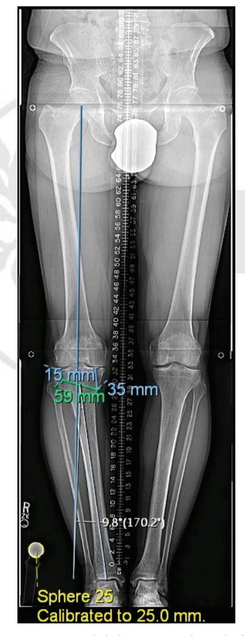
Fig. 2 Measuring proximal tibial osteotomy wedge angle of 9.8 degrees using the modified center of rotation of angulation (mCORA) technique. The longest blue line indicates the planned, new mechanical axis of the lower extremity. The green line is the osteotomy site, with the two smaller blue lines aiding its placement. The white lines measure the proximal tibial osteotomy wedge angle.

just proximal to the medial epicondyle to 6 cm superior to a tangent to the lateral condyle (green in -Fig. 1 ). Then, a 6-degree angle was drawn to the level of the osteotomy between the mechanical axis of the femoral head and the anatomical axis of the femur in the proximal third of the diaphyseal femur from the piriformis fossa (red in -Fig. 1 ). Finally, the angle was measured from the new, planned femoral head to the current femoral head, yielding the angle of correction planned at the DFO (white in -Fig. 1 ). Using simple trigonometry, the length of the osteotomy was multiplied by the tangent of this angle to