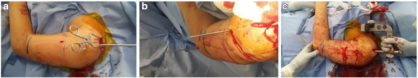
Fig. 2. a–c Intraoperative photos. a Entry point and while reaming the medulla. The 1-cm osteotomy wound is evident. b Proximal and distal pins to control the rotation. c Position while introducing the IM PRECICE nail.

has two modules: the disability/symptom section (5 subscales with 11 items, scored 0–100 points; the higher the score, the greater the disability) and the optional high performance Sport/Art or Work section (each scored 0–20 points). We did not include the optional modules as they were not related to our study and were not consistent with our patients' level of interest. The patients retrospectively answered the questions to report the functional status before and after humeral lengthening.