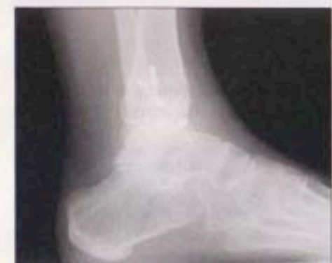
This 18-year-old woman presented with post-traumatic avascular necrosis; joint space narrowing is apparent.

"There seems to be a need for a joint preservation procedure in a patient who has reasonable range of motion of