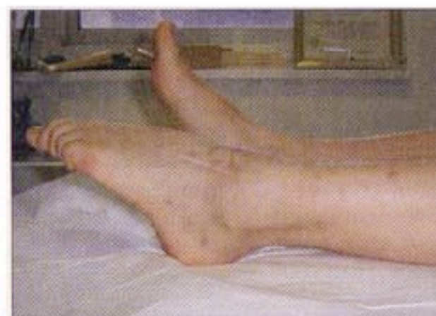
Another image of the patient's outcome.