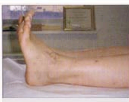
The patient maintained range of motion, as seen in this image.