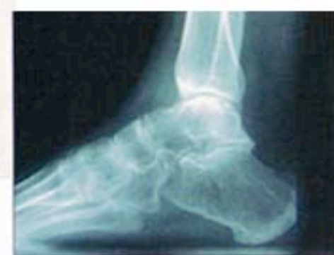
Here is the patient 2 years after wearing the Ilizarov fixator.

Patients also underwent a number of adjuvant procedures, including four ankle arthroscopies, one ankle arthrotomy, six supramalleolar osteotomies and five Achilles tendon releases, Rozbruch said.