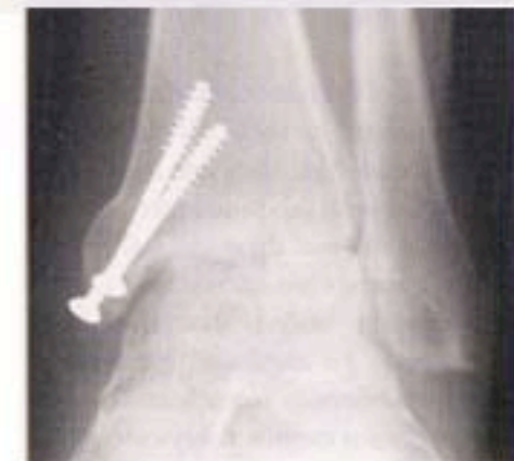
In the same patient, from the talar side osteonecrosis is evident.